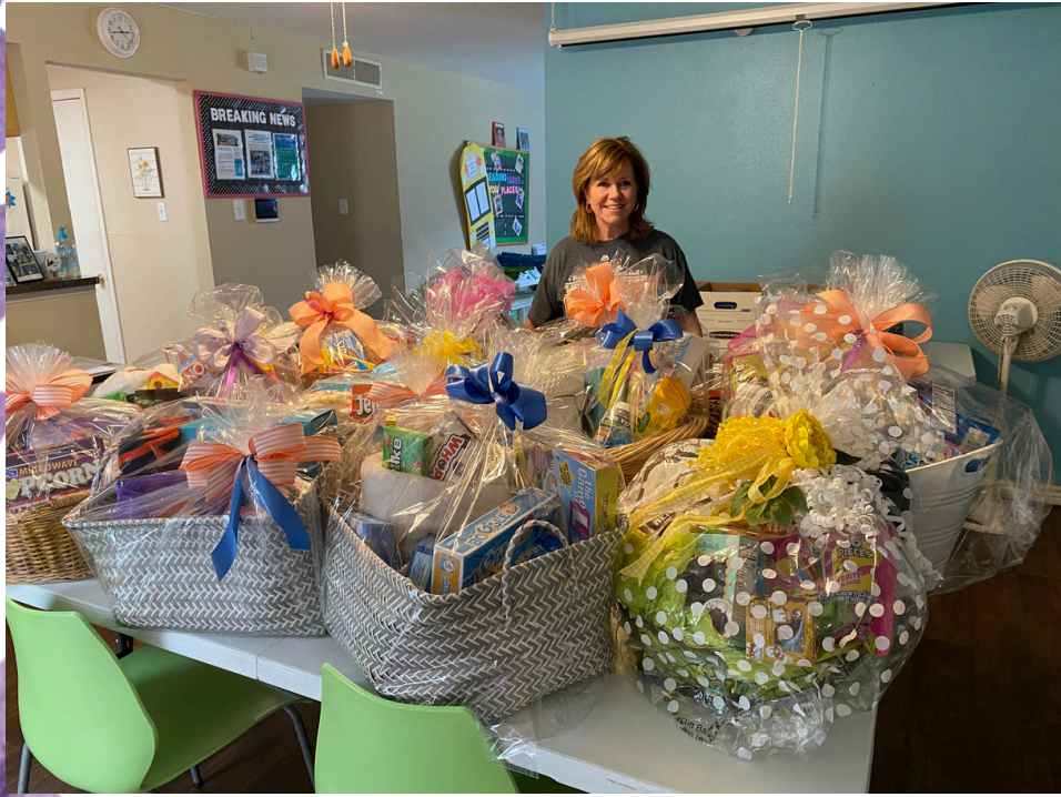
Reading Intervention door prize baskets